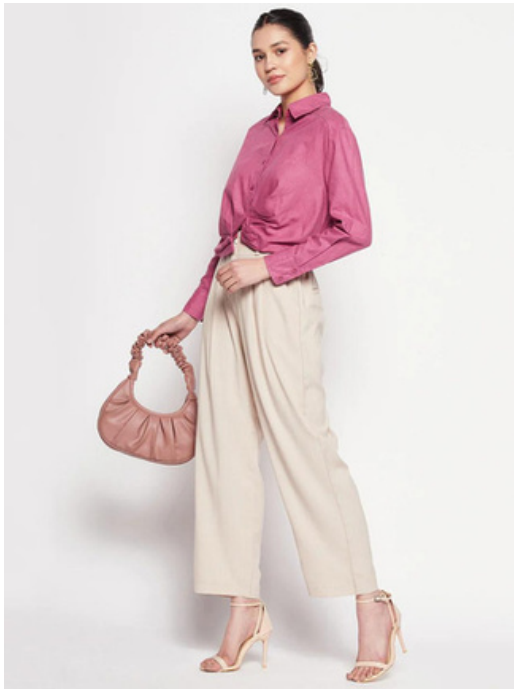
CO-ORDINATE SET - PINK SHIRT WITH STRAIGHT RELAXED FIT PANTS

It has been the month of Barbie. Barbie-pink hues have been in. That's why the now so famous pink shirt has become the staple in everyone's wardrobe. It can also be a risky color which needs extra attention when it comes to styling. So here are some of the best pink shirt outfit ideas for you!