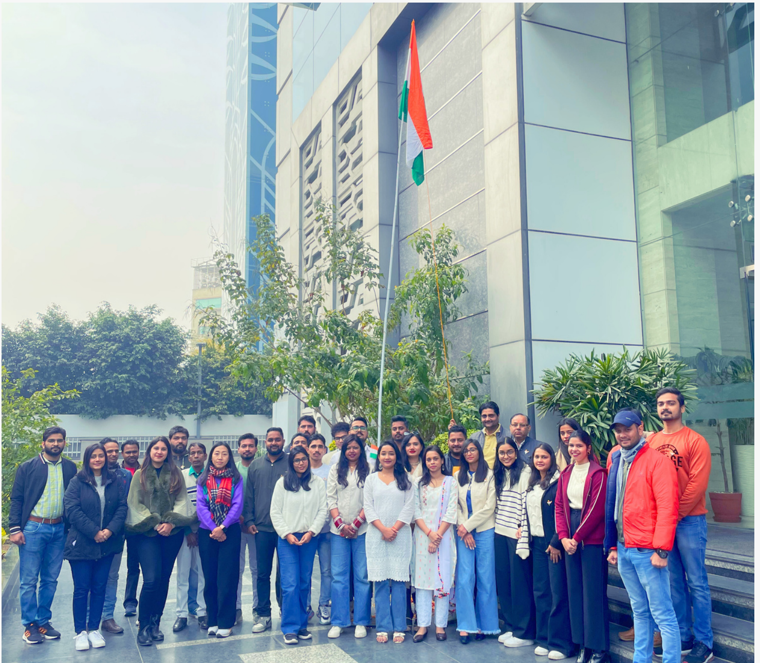
*Moment of the Month: #PeopleOfJainAmar celebrating Republic Day

JAIN AMAR HOUSE OF FASHION IS ONE OF INDIA'S LEADING FAST-FASHION CONGLOMERATES.