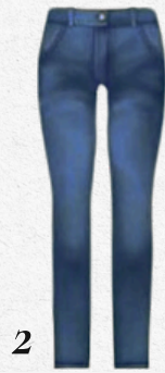
2 SLIM FIT