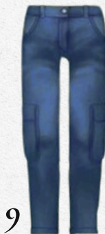
9 CARGO FIT